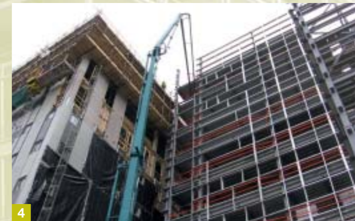
4 No problem to pump, even 200 meters high