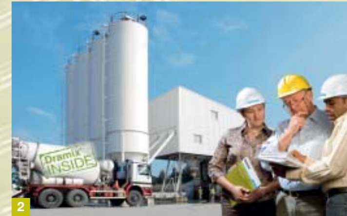
2 Together with your concrete professional we deliver a "pre-reinforced concrete"