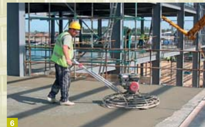
6 Perfect to finish. Time saving and efficient.