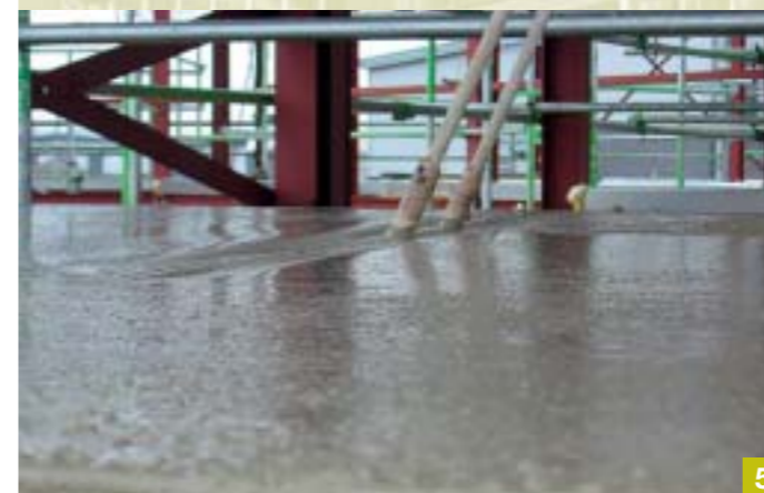
5 Easy to float. No fibres at the surface.