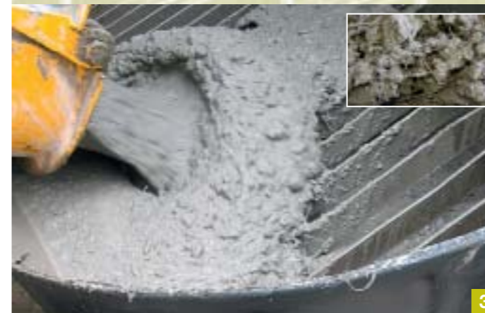
3 A homogeneously mixed Dramix® concrete is delivered on the jobsite