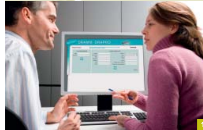
1 A safe and optimal design made and signed off by Bekaert and Kingspan